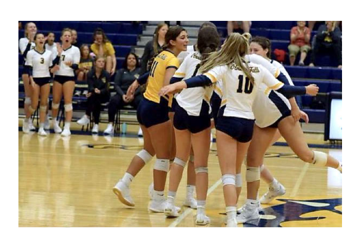
The Varsity Girls Volleyball Team huddles up before their game

This week there is a huge game versus Amherst at home (10/7). Come and support our bulldog ladies!