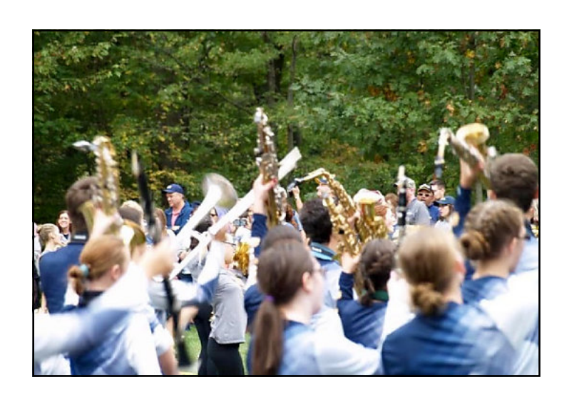
The Olmsted Falls Marching Band is pictured performing at last year's annual Falls Day In The Park event

If you're an animal lover, stop by Madison Park in Lakewood on October 16 between 12:30-3:30pm. Dogs of all shapes and sizes will be in attendance to make their Halloween costume debut. Entertainment, games, and dog-related vendors will keep you occupied until the dog parade officially starts at 2:00pm. Judges will be present and awards will be given to the most festive pups! Want your dog to be part of the fun? Pre-registration tickets are $10 per dog (humans are free). More information can be found at lakewoodalive.org.