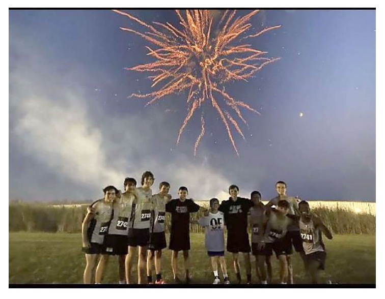
The Boys Cross Country Team takes advantage of a scenic opportunity to get a picture together